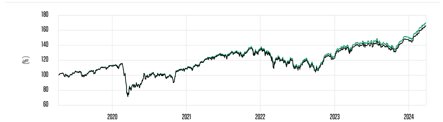
Cumulated Performance at 28.03.2024 (%)

This index is composed of the leading 50 companies in the euro zone, selected according to their market capitalisation, trading volumes and business sector. The index is weighted by country and by sector to reflect as closely as possible the economic structure of the euro zone. Due to its breadth and representative nature, the Euro Stoxx 50® has become the benchmark index for investors seeking to benefit from the growth prospects of euro zone equity markets.