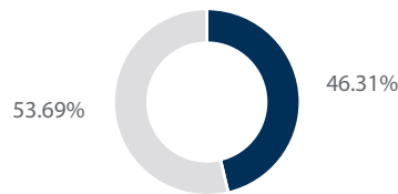
Top 10 Holdings as % of Total

Top 10 holdings as a percentage of Total Net Assets. Portfolio Holdings are subject to change at any time. References to specific securities should not be construed as a recommendation to buy or sell and should not be assumed profitable.